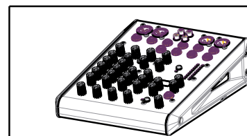
VISTA 3D / 3D VIEW