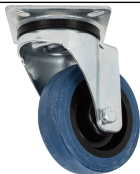
PRO SWIVEL WHEELS KIT