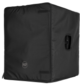
COVER CVR 003